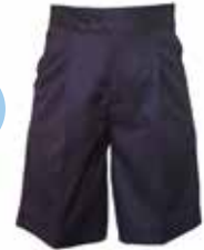
Shorts elastic back