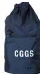
Junior Sports bag