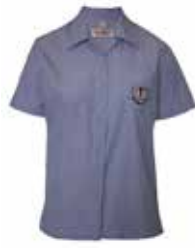
Short sleeve Blouse