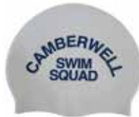
Swim Cap Squad