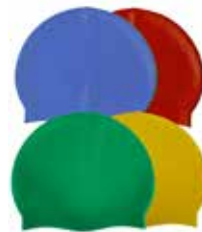
Swim Cap House