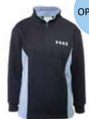
Top Qtr Zip