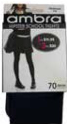
Tights Navy 70denier